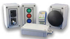
SeyWave® Wireless System

Combine a Digital Gateway II® controller with BTR components or any existing components in your facility to create a universal tailored door, dock or gate solution.