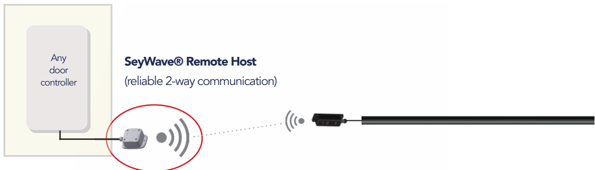
SeyWave® Remote Host (reliable 2-way communication)