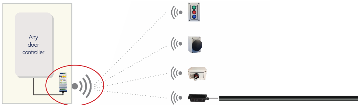
SeyWave® External Host (6 outputs)